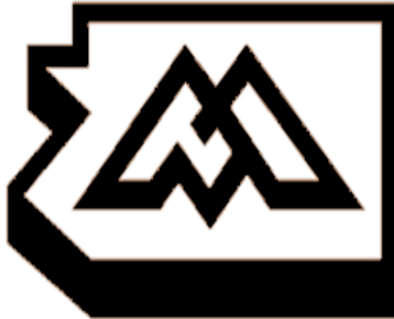
ARIZONA MINING ASSOCIATION